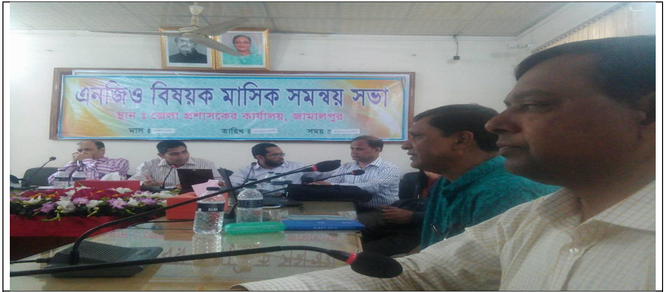
. Proships representative presence in District Coordination Meeting at DC office Jamalpur