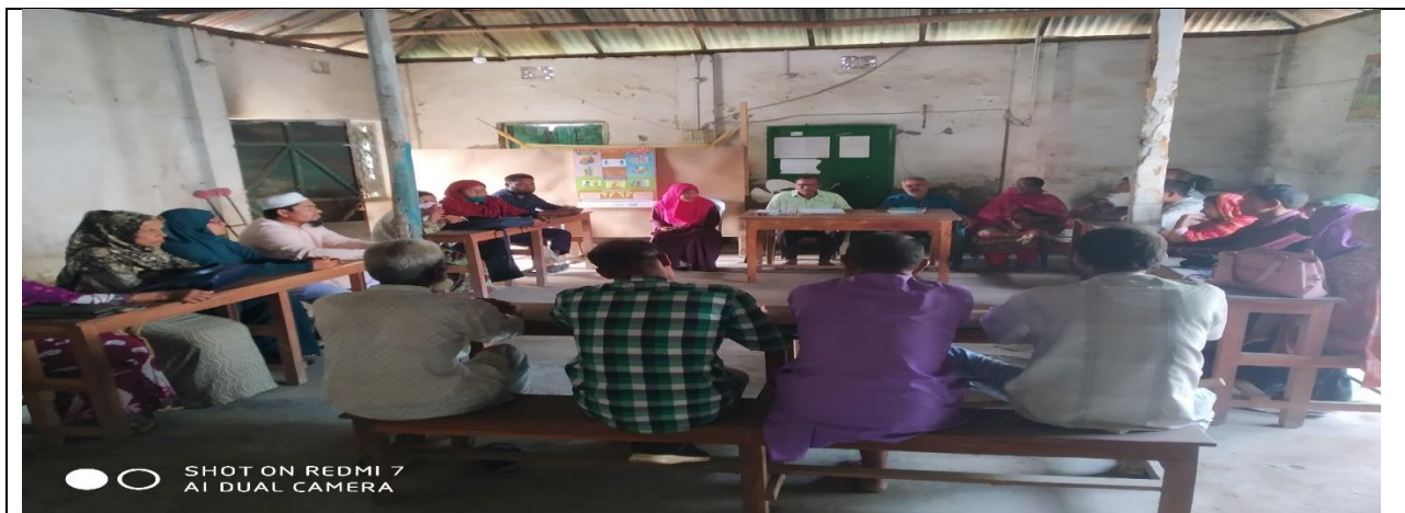
Proships conducted orientation with DPO Group leader on Disability Inclusive disaster and preparedness 2023