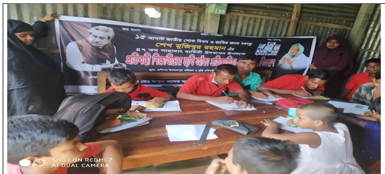
Teacher Facilitating Class on Drawing with Islampur NDD Disable Children School .