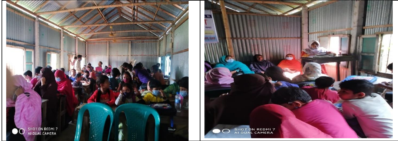
During the year proships conducted discussion meeting with several school children on Prevent Dengue out Breaking and others infected virus