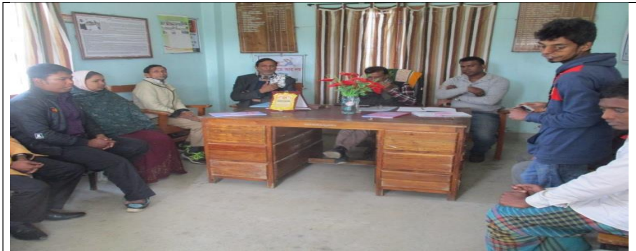
Meeting with Sarderpara SHG

During the year Self Help Group members started Saving activities its their own initiatives Members are bring to their Groups at time of Monthly Meeting and all the members saving collected in their own leaderships. In these purpose they are formation committee by the Groups members and Treasurer Collected saving money and taken decision to distribute in to the members and who have need loan one or two members taken as a Loan for income Generating activities.