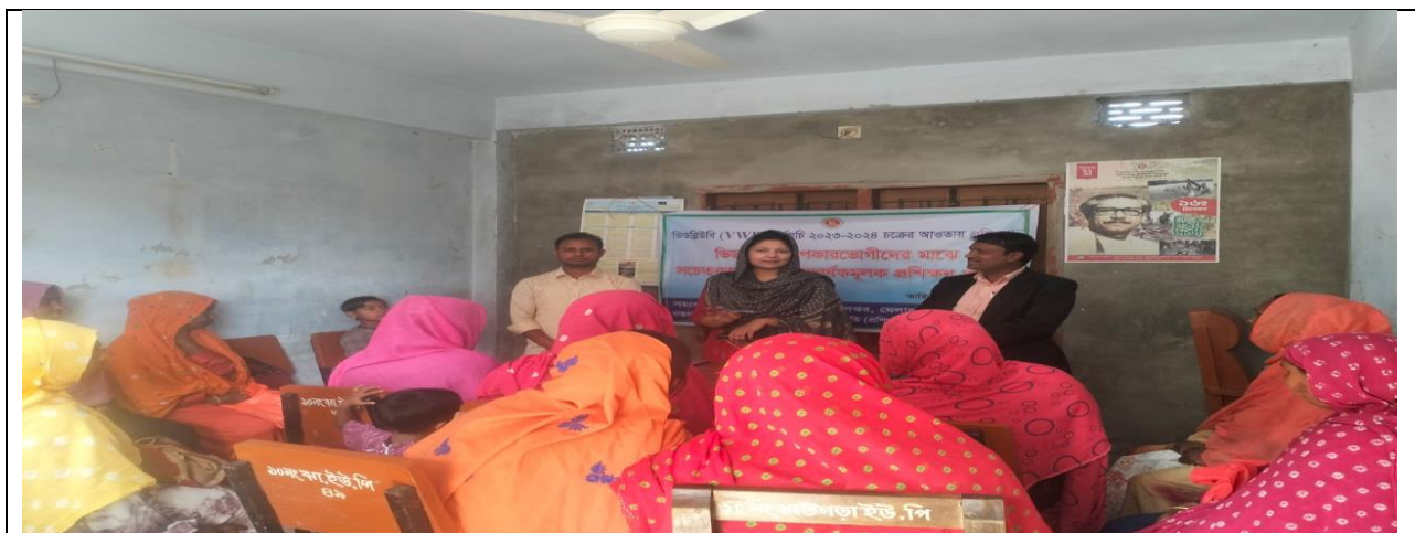
During the over year conducted 11 Unions Parishad and organize Awareness Orientation and training mention this issues in each session. Upazilla Women affairs officer /Govt. official visit the respective program