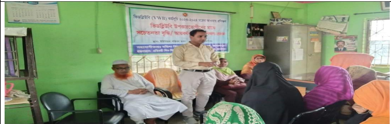
During the over year conducted 11 Unions Parishad and organize Awareness Orientation and training mention this issues in each session. Upazilla Women affairs officer /Govt. official visit the respective program

Providing microcredit, vocational training, and support for small businesses to generate income. Ensuring access to literacy and vocational training to increase employability, Improving maternal and child health, family planning, and nutrition programs. Implementing targeted social protection programs, including cash transfers and food assistance. Promoting women's leadership and decision-making, building self-confidence, and addressing gender-based violence. Improving access to clean water, sanitation, and transportation in rural areas. By addressing these areas, initiatives can help break the cycle of poverty and create opportunities for ultra-poor women to build better futures