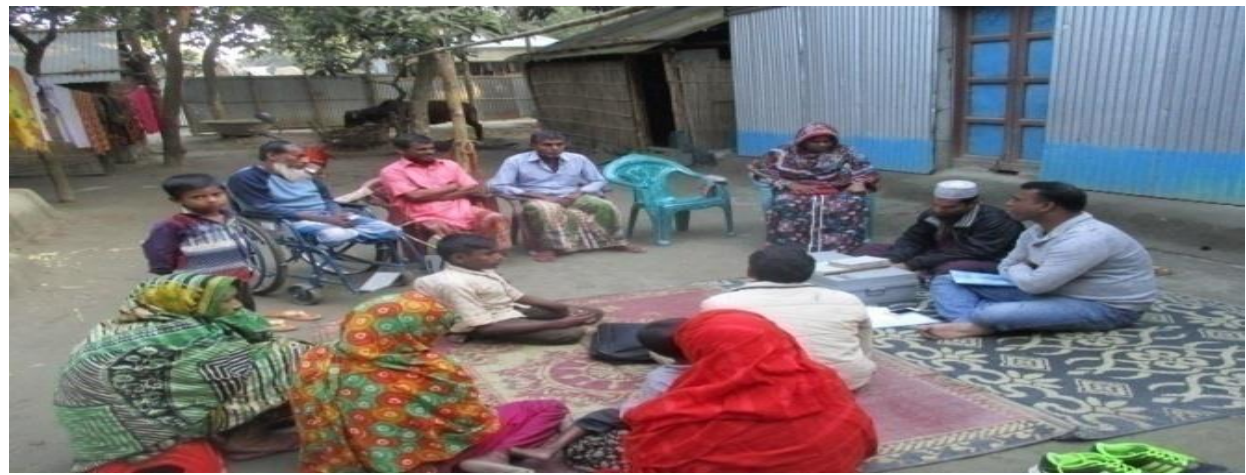
Meeting with Dewangonj Union SHG