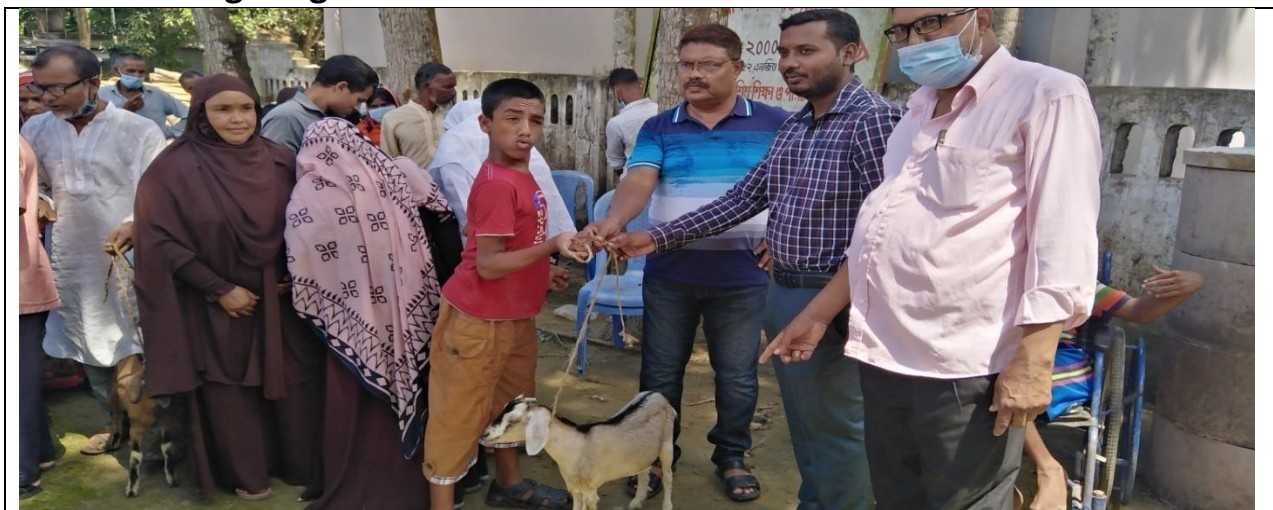
Proships support and Provide Goat in to Family of the Adolescent Boy for home base Goat farming Supported by Global Giving Foundation USA.