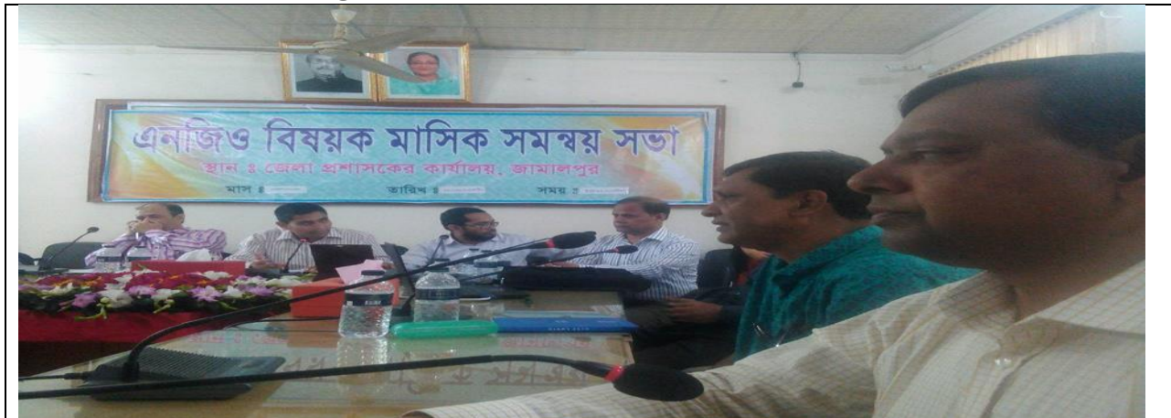
. Proships representative presence in District Coordination Meeting at DC office Jamalpur