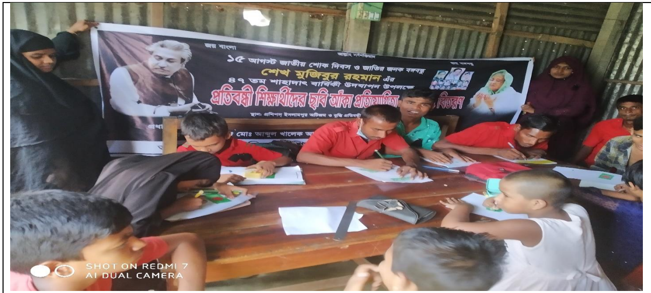
Teacher Facilitating Class on Drawing with Islampur NDD Disabled Children School .

Achievement and out put- Proships running 2 (Two) special need school for the all categories children with disabilities in the community at Kacharipara Islampur upazilla sader, and other one is Dewangonj Upazilla with a view to ensure educational rights. It is working to prepare disable children as pre schooling activities for their further enrolling existing primary school in the community. This program supported Global Giving Foundation and Bangladesh National Social Welfare Council (BNSWC) Ministry of of Social welfare Govt.of Bangladesh.