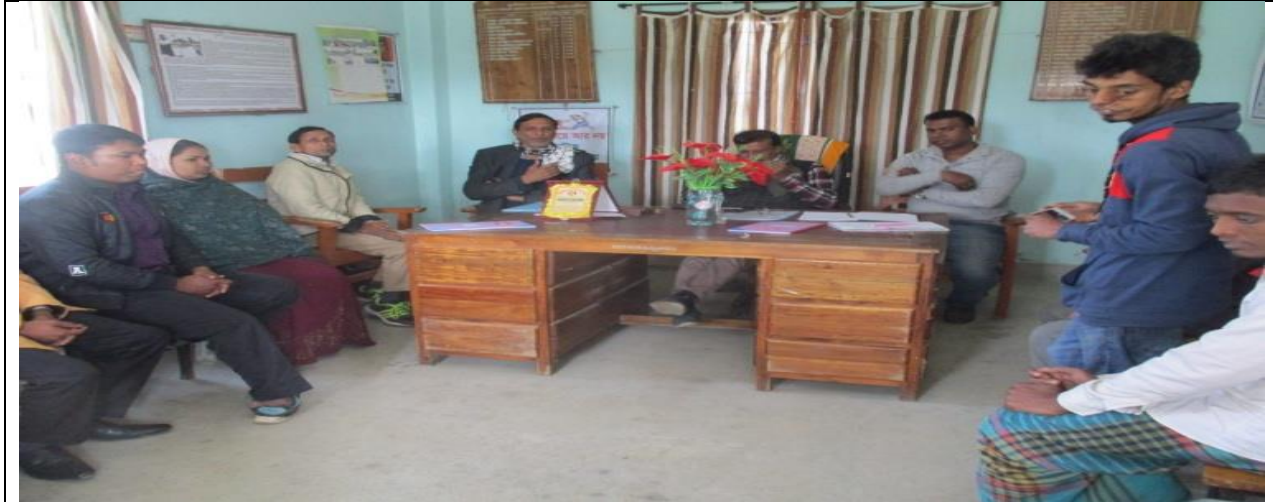
Meeting with Sarderpara SHG